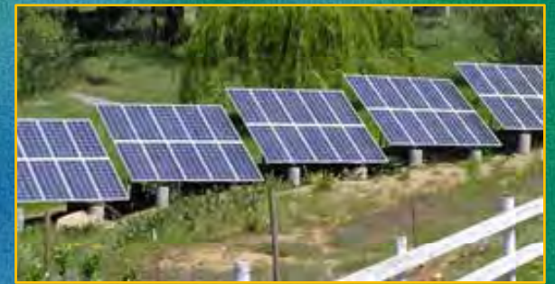
ground mounted solar panels