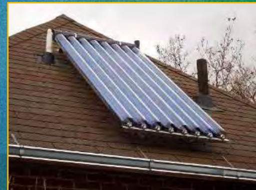
roof mounted water heater