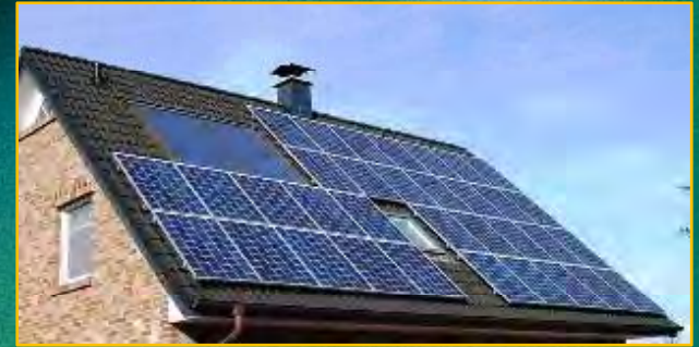
roof mounted solar panels